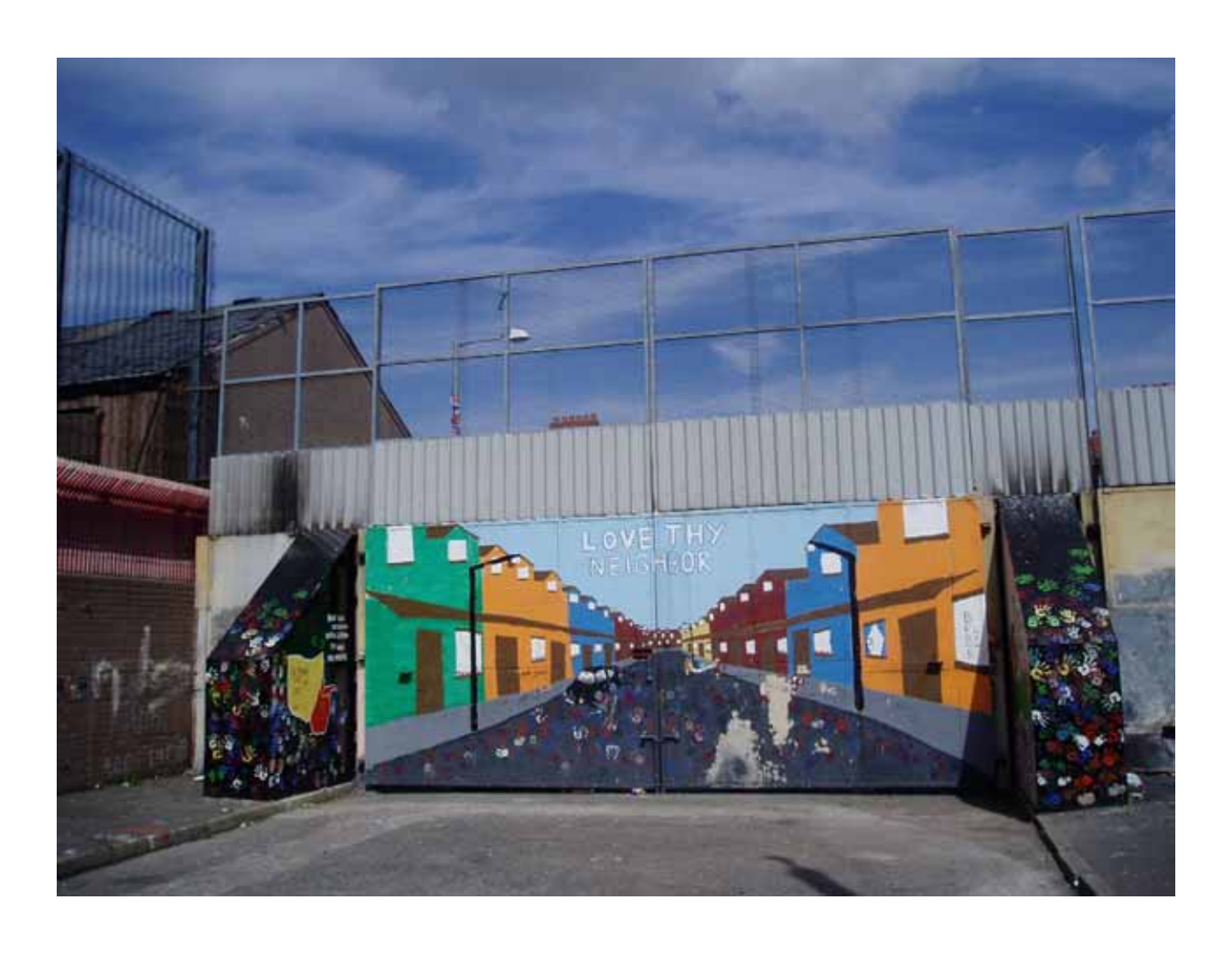
One of the remaining fifty-seven peace lines still dividing neighbours and communities in Northern Ireland