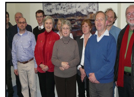
Some members of the Dublin Council of Churches