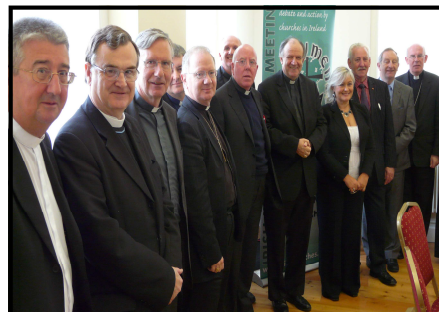
Some members of IICC Executive 2008