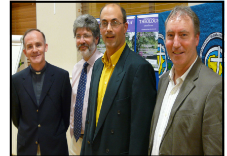
Launching the new Certificate in Theology (Mater Dei and Edgehill College) at Dromantine