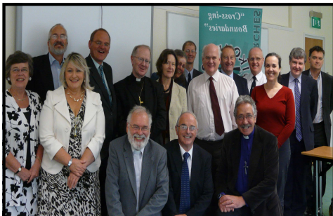
Some members of ICC Executive 2008