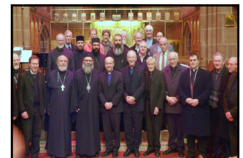
Antiochian Orthodox Church hosting local church leaders to the opening of their Icon exhibition in North Belfast