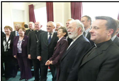
Faith leaders at a reception with Taoiseach Bertie Ahern in Government Buildings, Dublin