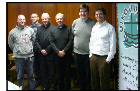
Local clergy and lay staff active in the Dungannon area at an ICC Executive meeting