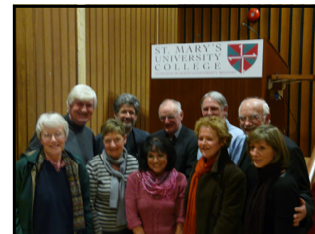
Some members of Clonard-Fitzroy Fellowship