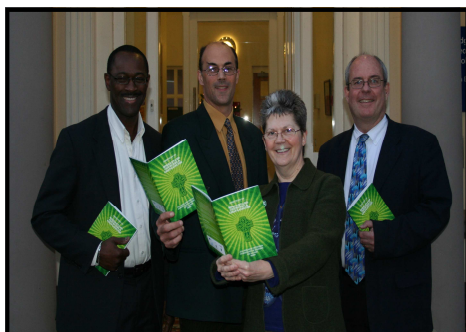
Launch of the Directory of Migrant-led Churches in Belfast by AICCMR