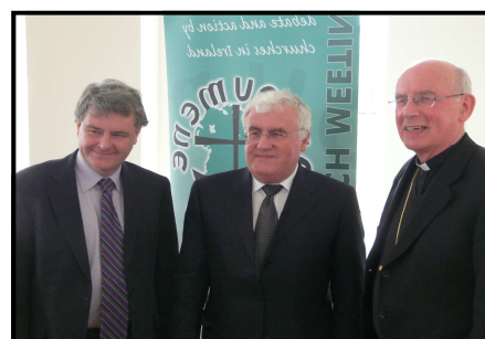
ICC Co-chairs welcoming Hon Dick Roche TD to an IICC Meeting in April 2008