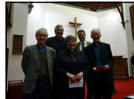
Some members of the Ballymena Clergy fraternal