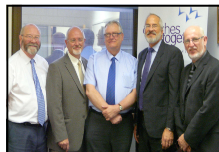
General Secretaries from ACTS (Scotland), CTBI, CTE (England), ICC (Ireland) and CYTUN (Wales)