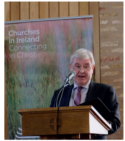
reconciled community and reconciled family of God.