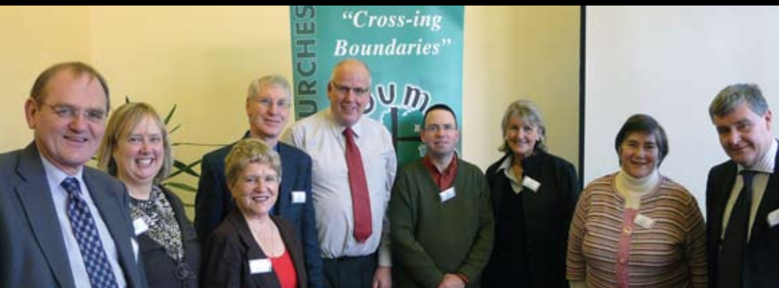
Church representatives attending the ICC Consultation on Ministerial Health, November 2009