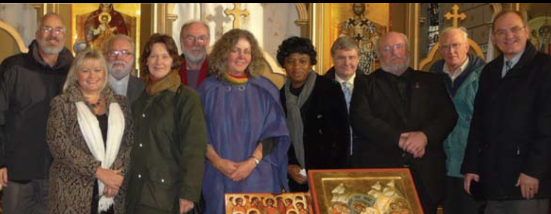
Members of the ICC Executive visiting the Romanian Orthodox Church in Dublin, November 2009