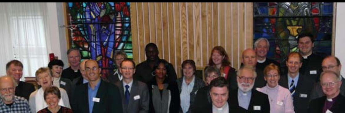
Some delegates attending the IICM Study day on Baptism, November 2009