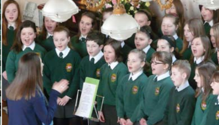
A local school choir singing at the ICC AGM in Gracehill, Co. Antrim, April 2009