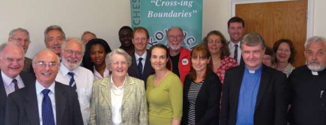
Members of the ICC Executive Committee August 2009