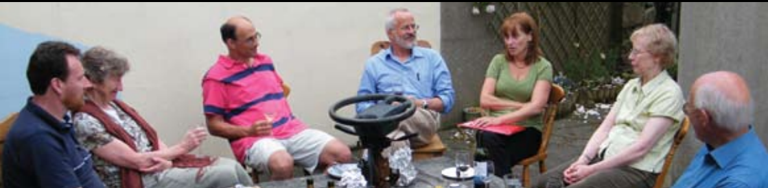
Some members of the All-Ireland Churches Consultative Meeting on Racism (AICCMR) enjoying a summer barbeque.