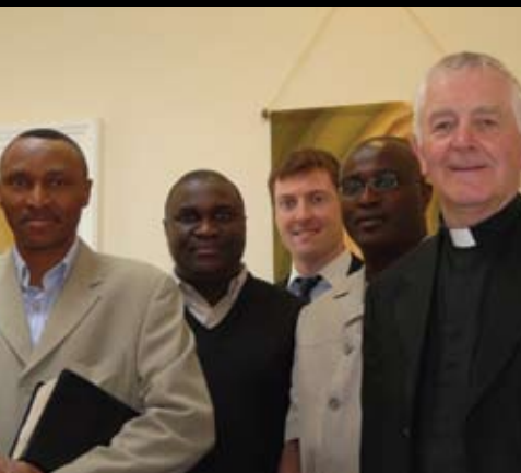
Some attendees at the IICC round-table with African Pentecostal Leaders – June 2009